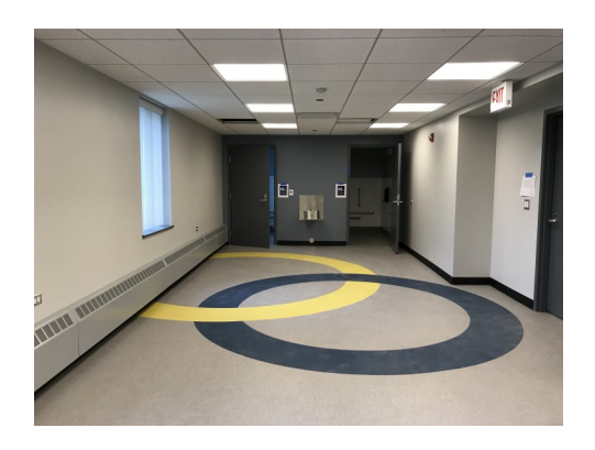
Renovated Room inside the Benedict Center