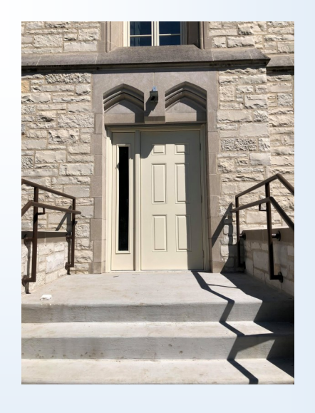
God has blessed us From Generation to Generation so please join us today from 10:30am until 2:00pm for an OPEN HOUSE of the Benedict Center.

Take a walking tour and see the fruits of our labors of the past year.